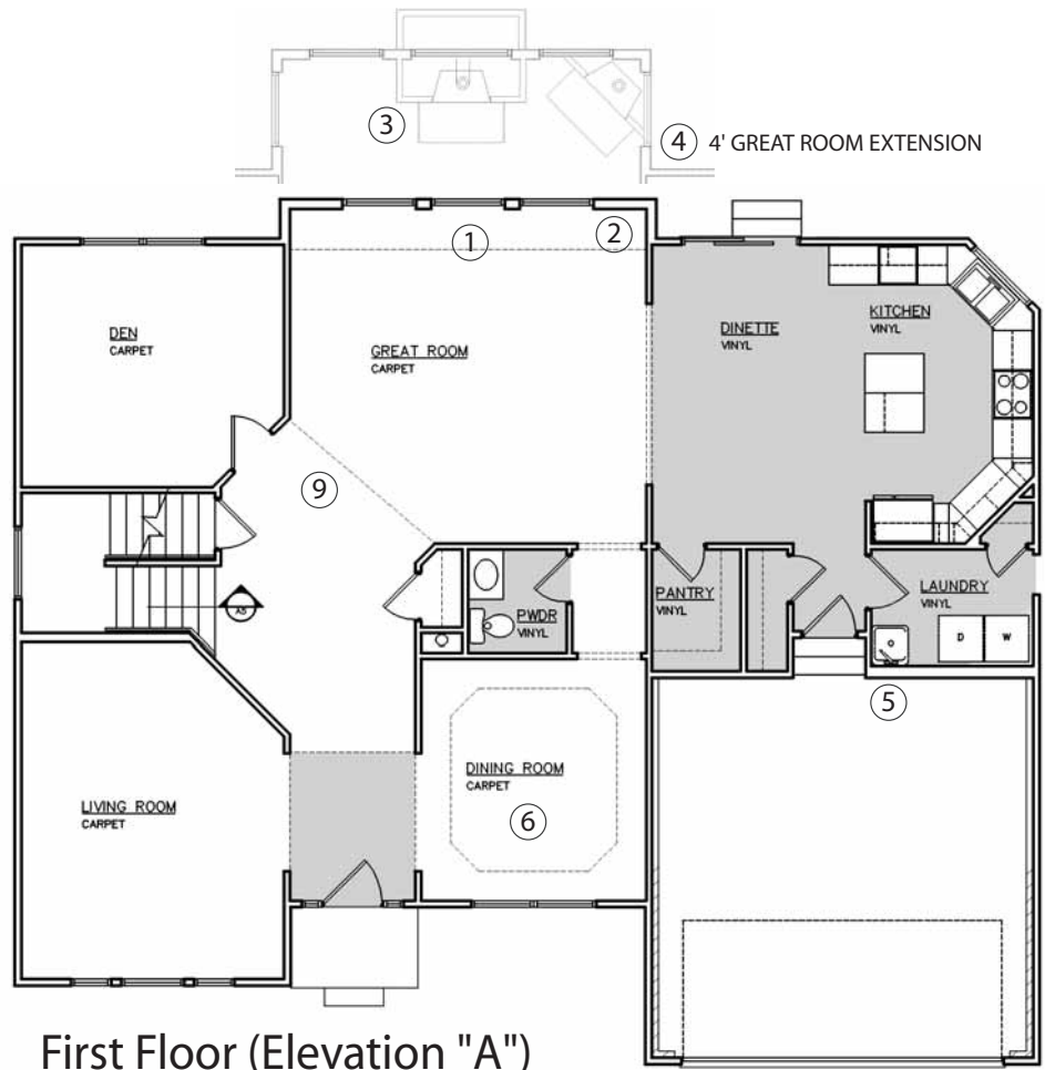
First Floor (Elevation "A")