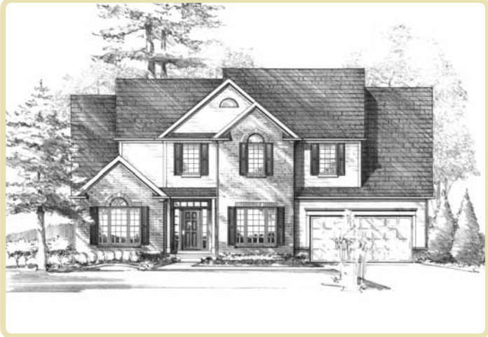
ELEVATION C (With Optional Brick)