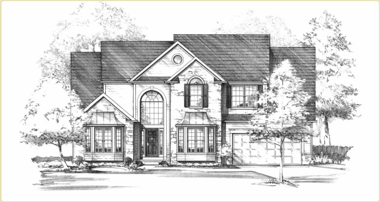
ELEVATION P (With Optional Stone)